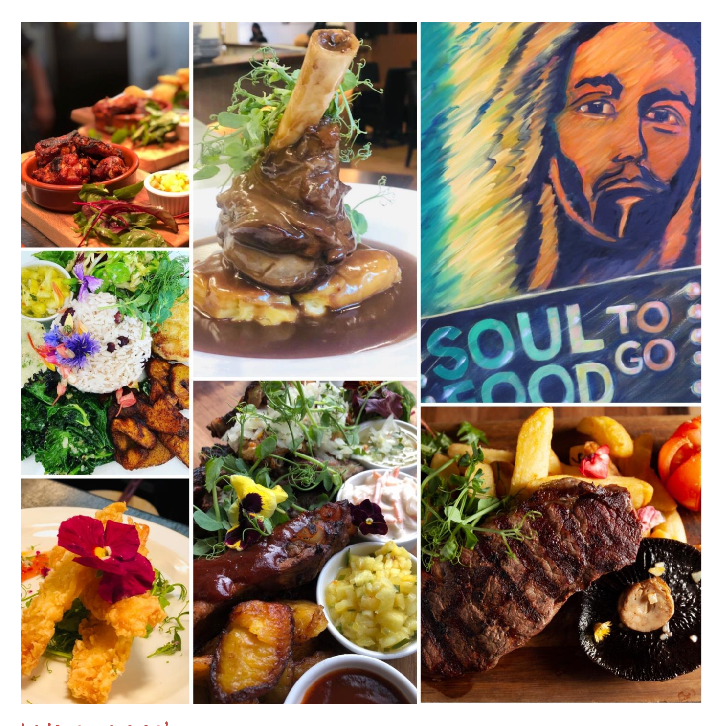
We suggest... Please do check out our website and social media for more photos of our food. We suggest selecting a maximum of 3 choices of starters, mains § desserts per party. A 20% deposit secures the booking with the full amount payable 2 weeks before the event. Please do let us know any special requests, allergies, or dietary requirements by this time. We look forward to catering for you and wowing your taste buds!